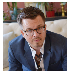
RICHARD KAISER WILDERNESS AGENCY