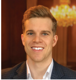
JOE FLARIDA POWER A CLEAN FUTURE OHIO