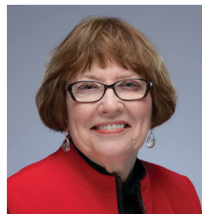
COMMISSIONER JUDY DODGE MONTGOMERY COUNTY (Welcoming Remarks)

Organized around three pillars of execution – Net Zero Places, Responsible Supply Chain , and Healthy Communities – the healthcare organization has made bold steps to drive lasting change across more than 2,600 sites of care and 136 hospitals in 19 states .