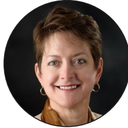
SUZANNE KOEHLER COMMUNITY HEALTH NETWORK