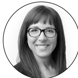
SARAH WOOD RATIO ARCHITECTS