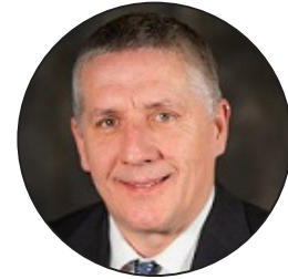
MIKE KUHN COMMUNITY HOSPITAL EAST